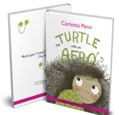
The Turtle with an Afro